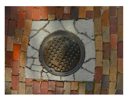
Orlando Manhole Cover