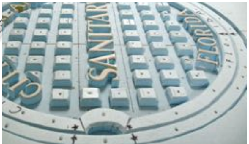
Dressmaker pins or slim nails anchor foam pieces