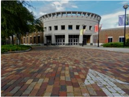
At The Orlando Museum of Art