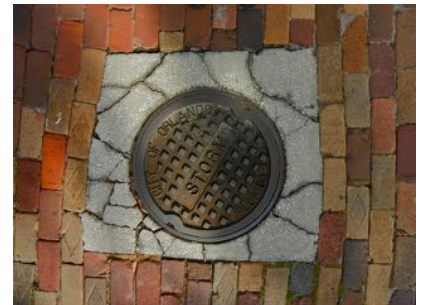
Orlando Manhole Cover