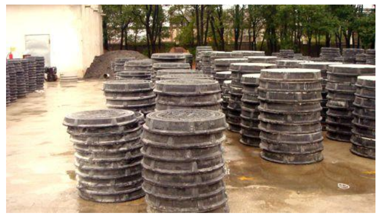
Stacked Manhole Covers at Briscover Factory in Changsha China

The Marvels of Manhole Covers (A Guest Contribution)