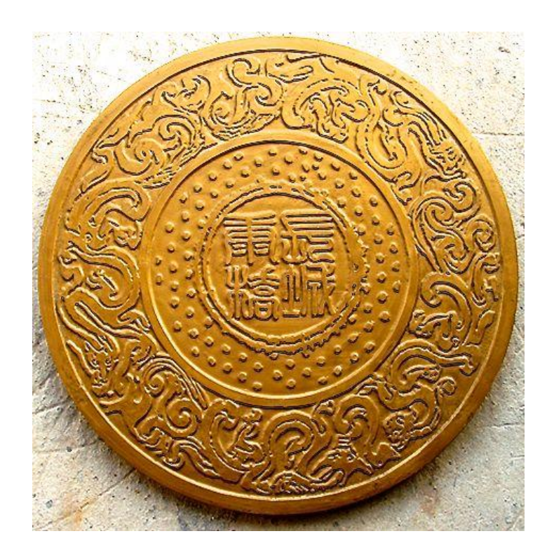
"KANGQIAO GREAT WALL" Manhole Cover by Briscover.com in China

This has spawned an unusual activity called "drain spotting" that involves people taking photographs of different sewer covers spotted by them on the street. Some are round, some square, some rectangular while others are elliptical. Some of the sewer cover moulds have designs while others are plain with the Municipal Corporation's name marked on them. Japan is a country with very artistic sewer covers, complete with flowers, birds or human designs in a variety of colors.