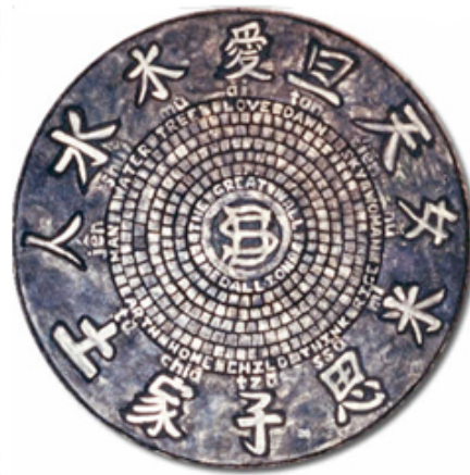
"Great Wall Medallion" 1984 by Bobbi Mastrangelo 36 "Dia.