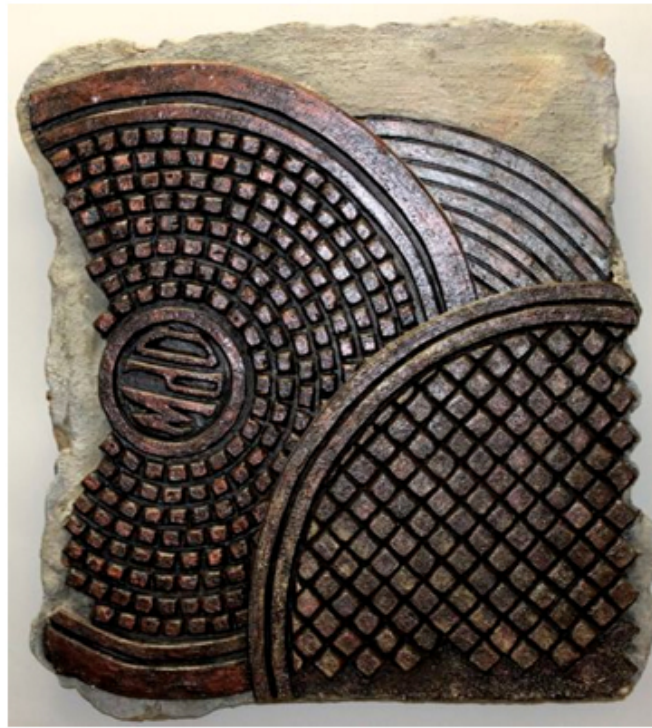
"Three Sewers" 1995 by Bobbi Mastrangelo 34" x 30" x 4"