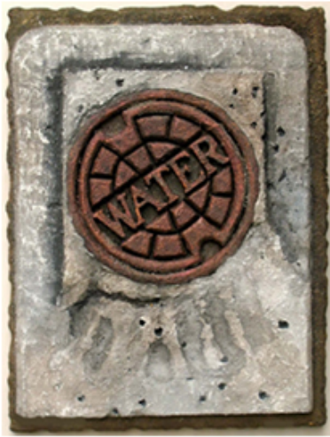
"Glendora Water" 2013 by Bobbi Mastrangelo 18" x 14" x 2"

You can see more of her realistic presentation of covers we have become familiar with - water, sewer, coal. She even replicates the glass light vaults. The story behind Three Covers, and how they often became "bases" when a "city street turned into an asphalt field of dreams for kids", is HERE .