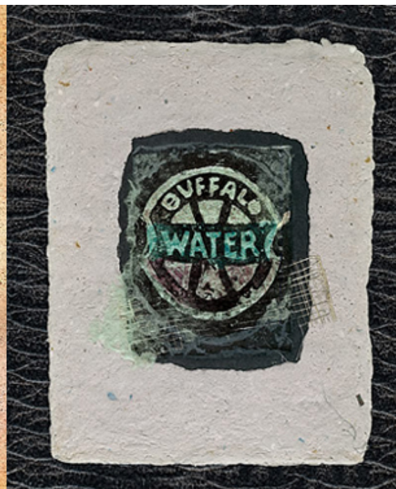
"Buffalo Water" St. James, NY