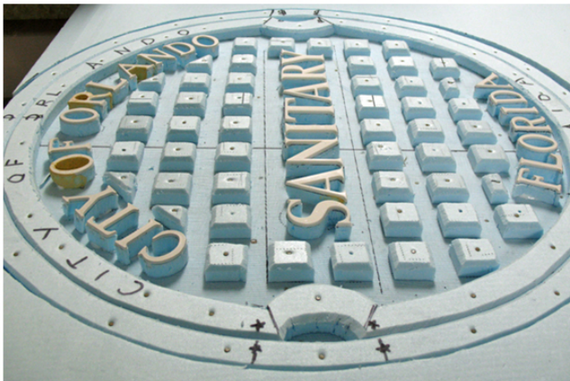
work in progress - cover created from blank foam

See the full story of her submission to Orlando Museum of Art, "City of Orlando" HERE .