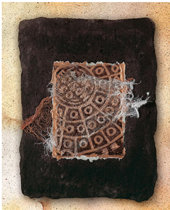
"Con Edison Black", NY metro area