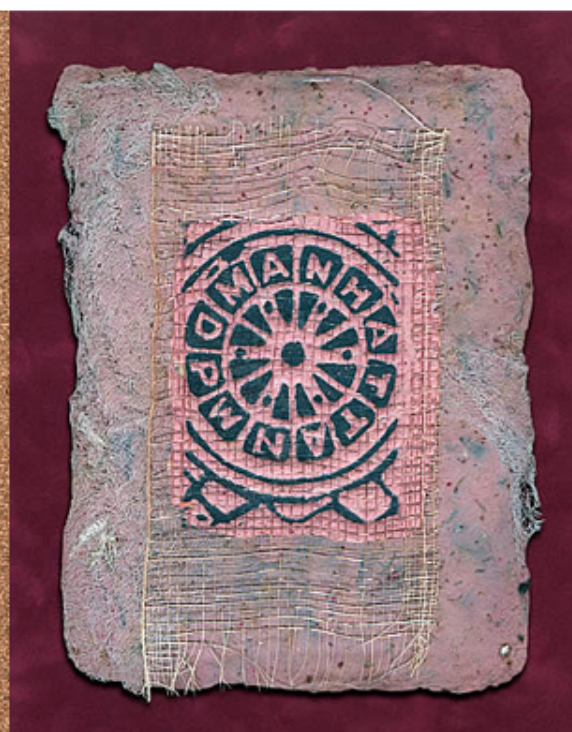
"Manhattan DPW" NY

Bobbi Mastrangelo's Grate Little Giclees - Limited Edition 12" x 10" hand-signed archival prints