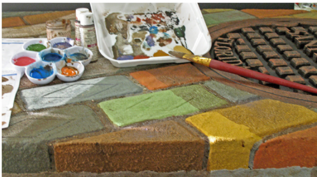
foam coated with plaster gauze, cement, acrylic paint, antiquing - and the final layer to close the gaps: simulated moss and actual cinders from our street